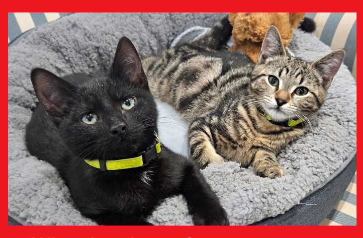
What does it cost? $400 per year

We believe all pets are important and that they deserve the very best care we can provide. With this in mind, we have developed our Pet Group package to make your cat's preventative health care simple, affordable and most of all very convenient. This will help you provide all the essential care your pet needs over a year, leaving you with peace of mind and more time to enjoy them.